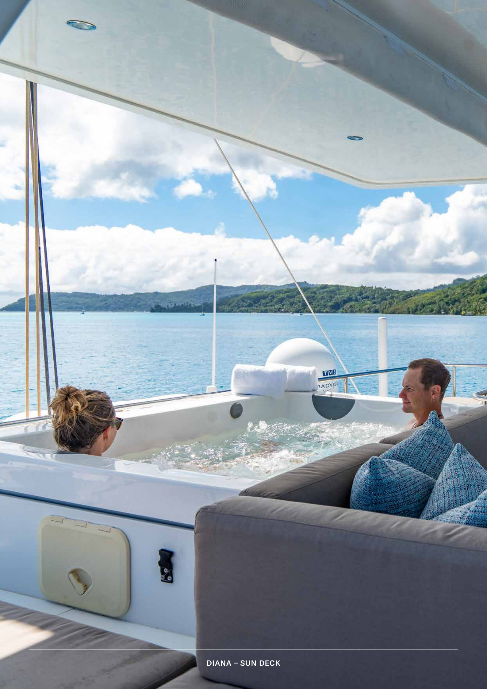
DIANA – SUN DECK