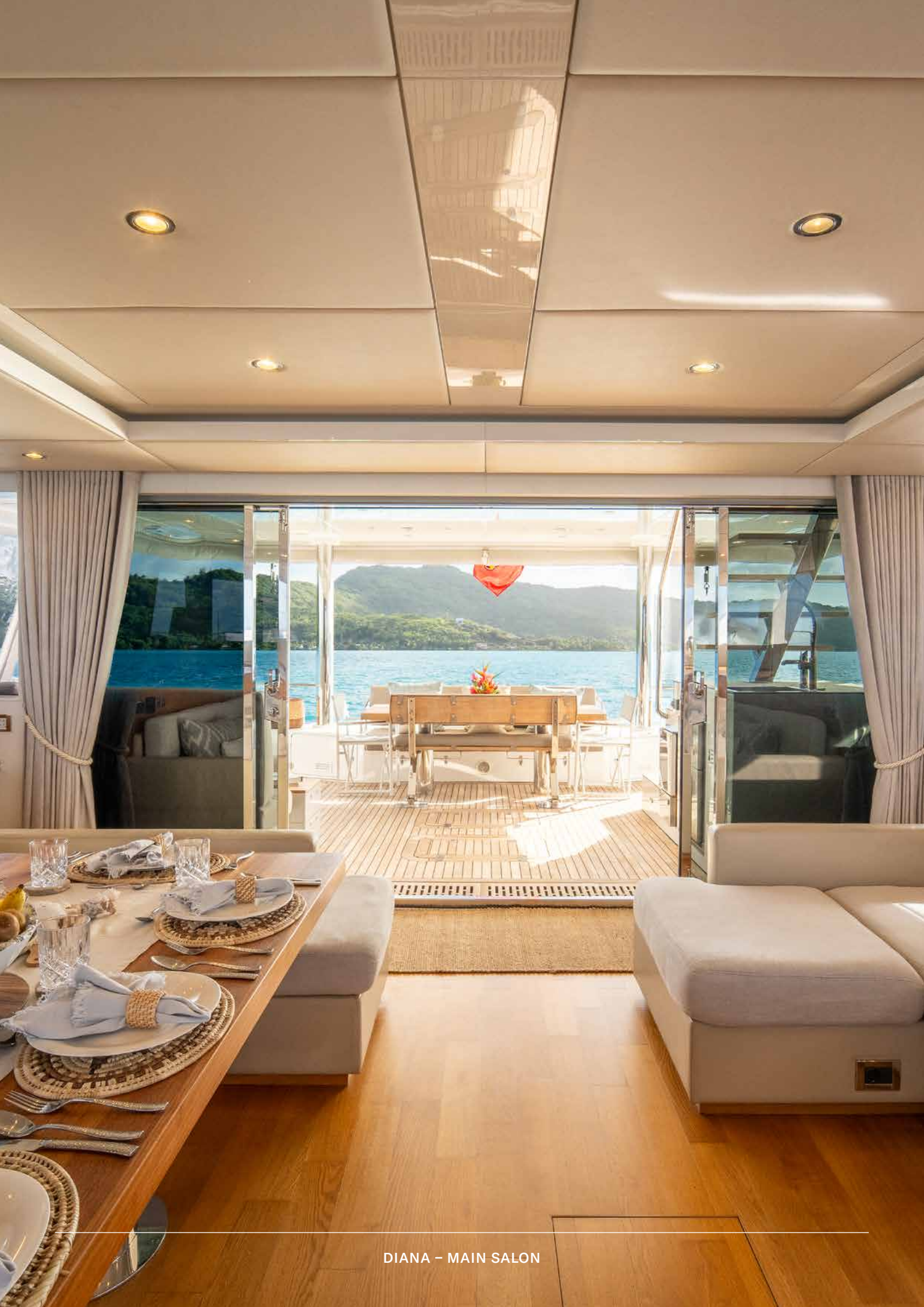
DIANA – MAIN SALON