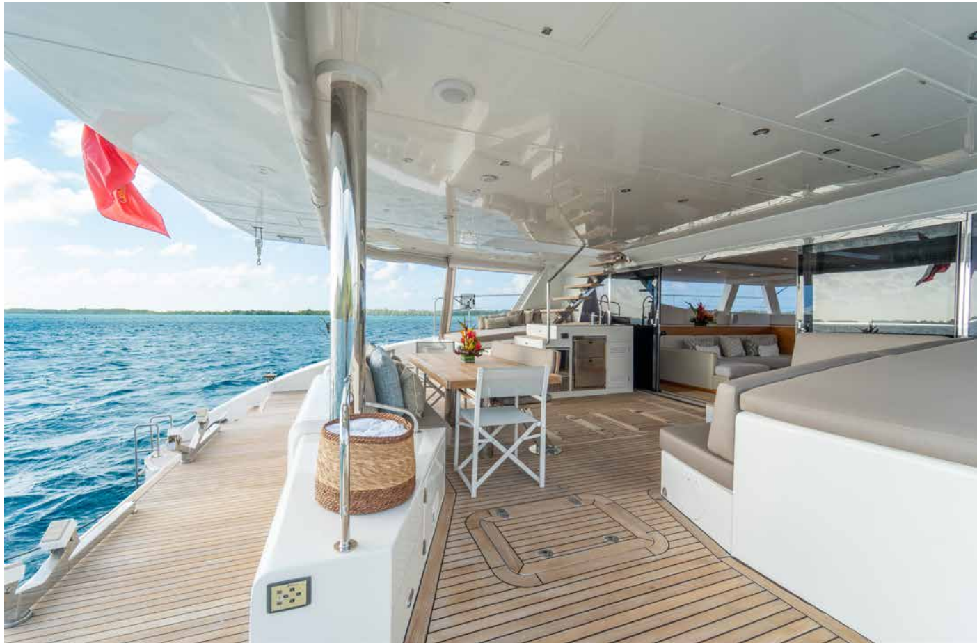
DIANA – MAIN DECK