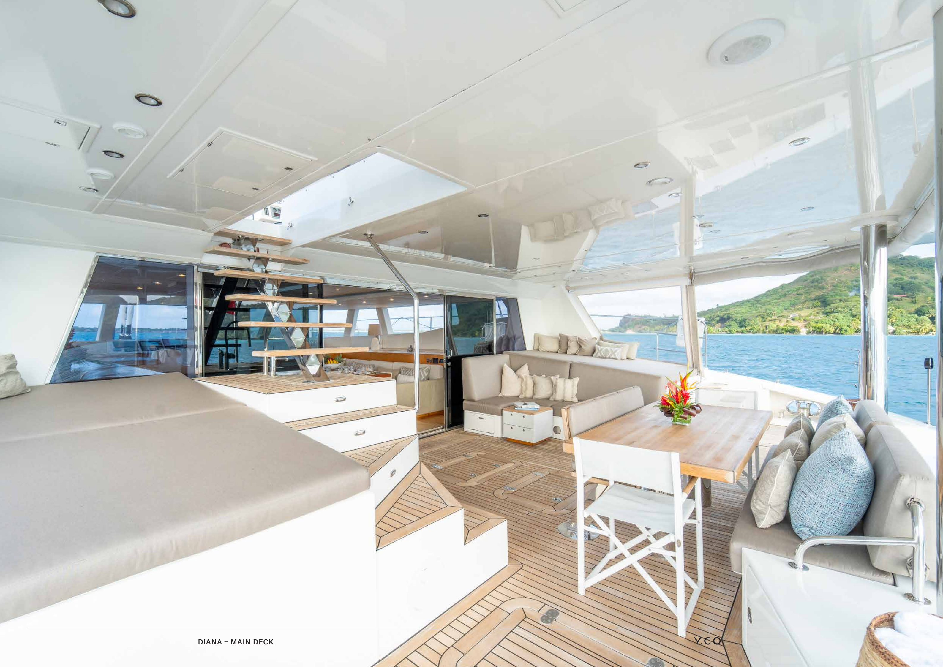
DIANA – MAIN DECK