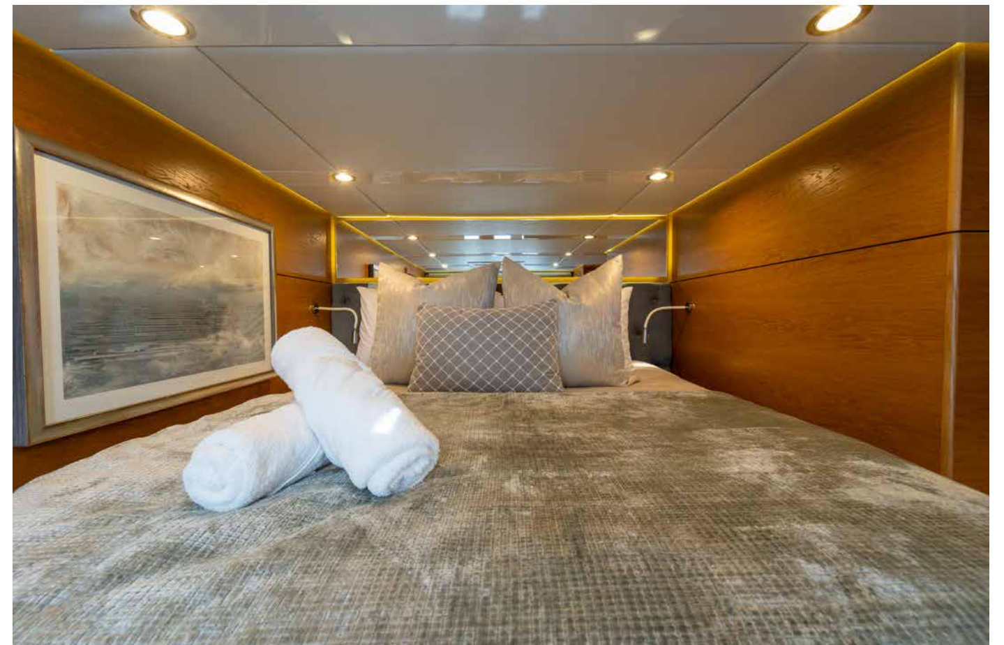
DIANA – GUEST CABINS