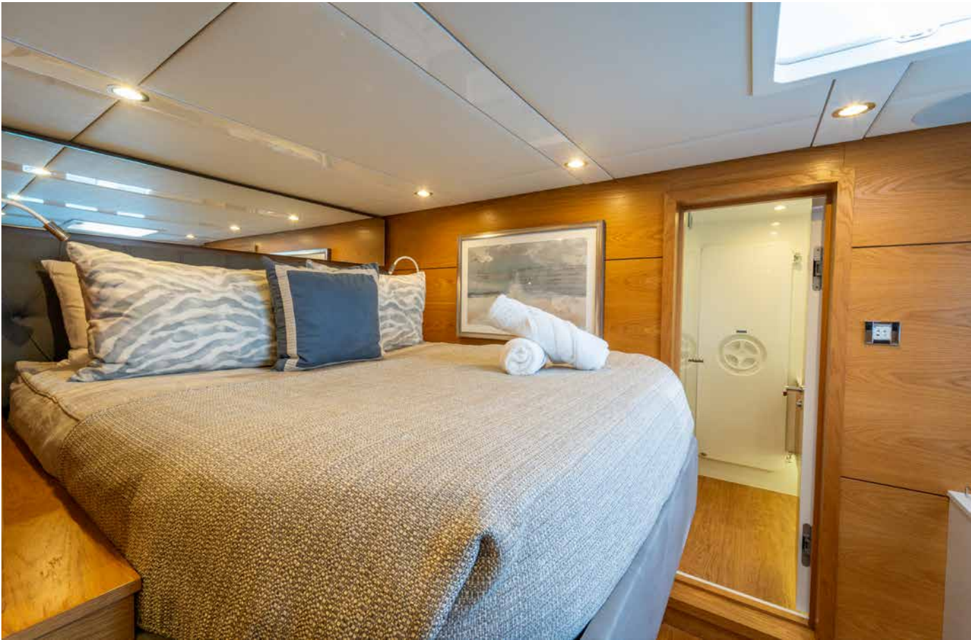
DIANA – GUEST CABINS